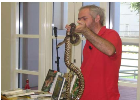
Parliament House Library Talk