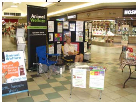
Palmerston Shopping Centre Display